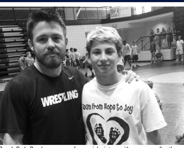
Coach Cody Sanderson poses for a quick picture with a camper after the technique session at the 2015 camp.